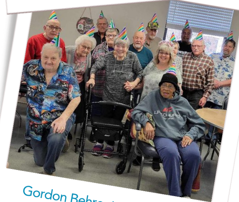
Gordon Behrents Senior Center