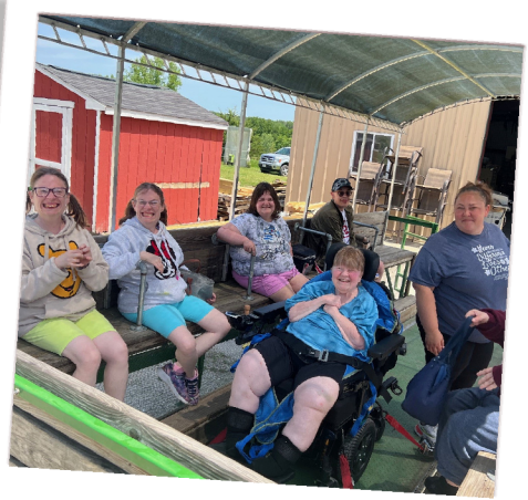
Community Day Services